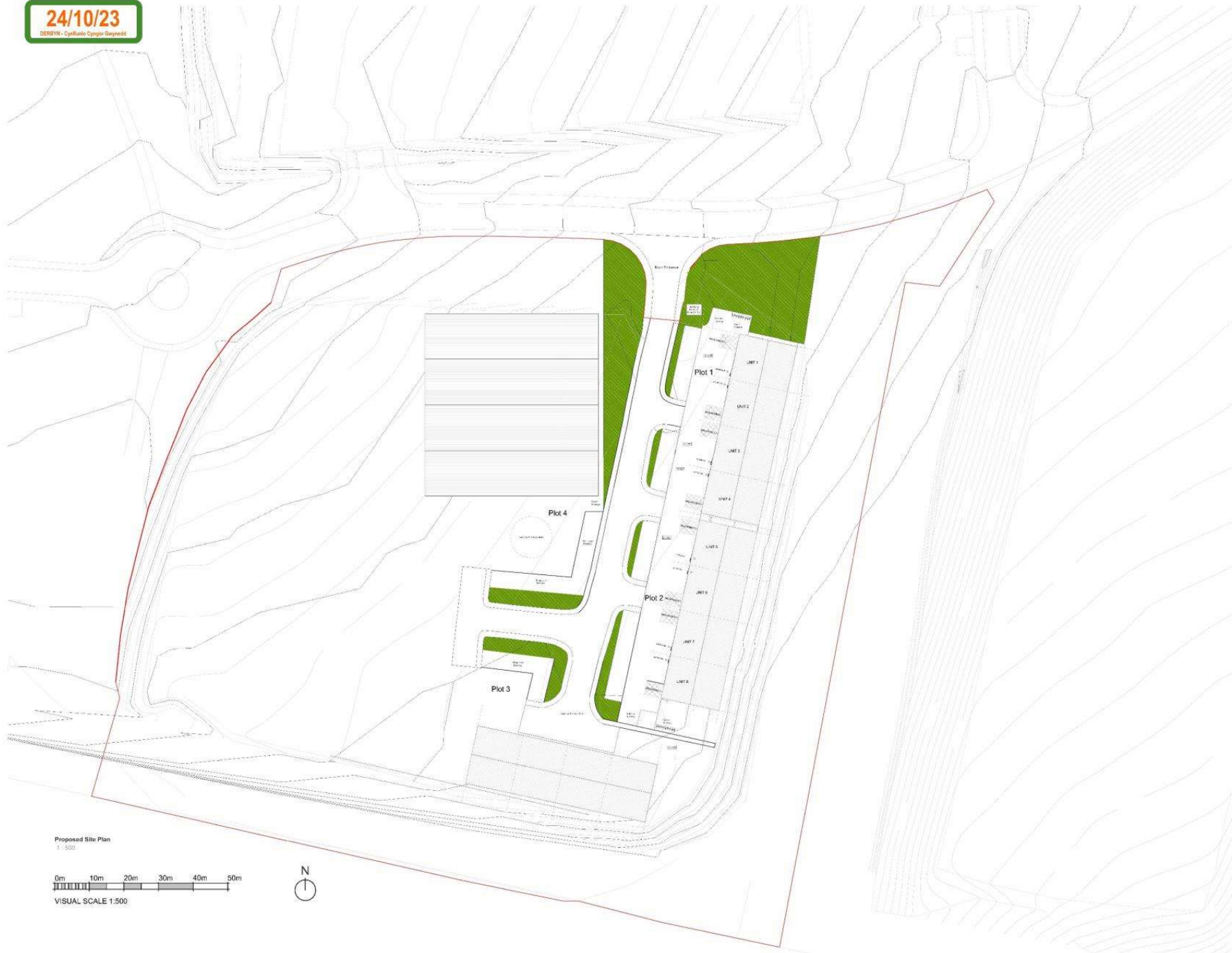
Proposed Site Plan 1:500